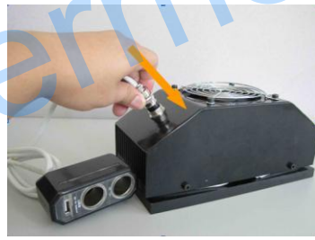
2) Align and insert