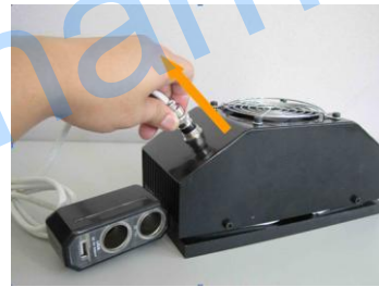
3) Pull out