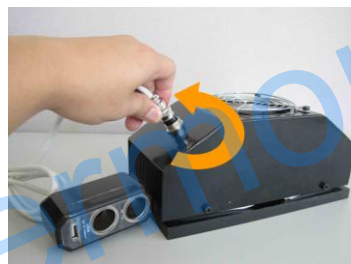
2) Anticlockwise rotate to unlock