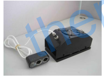
4) Completed installation