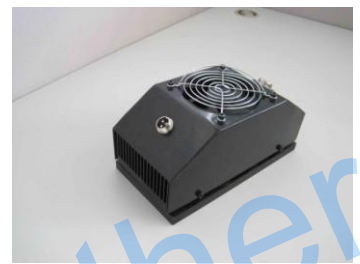
4) Completed disassemble