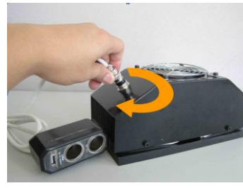
3) Clockwise rotate to lock